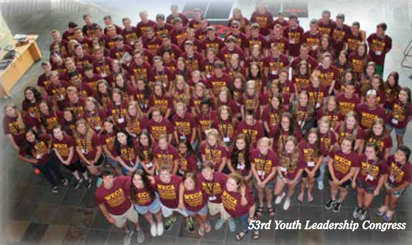
53rd Youth Leadership Congress