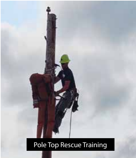
Pole Top Rescue Training