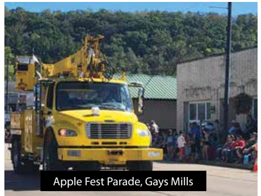
Apple Fest Parade, Gays Mills