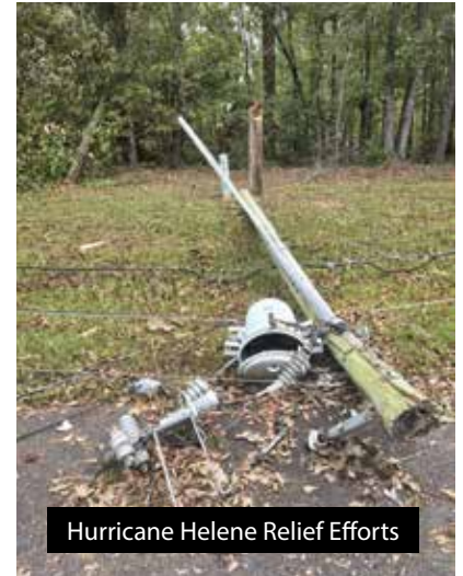
Hurricane Helene Relief Efforts