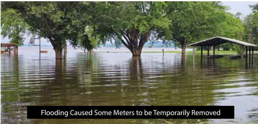
Flooding Caused Some Meters to be Temporarily Removed