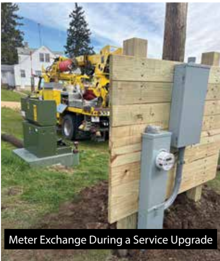
Meter Exchange During a Service Upgrade