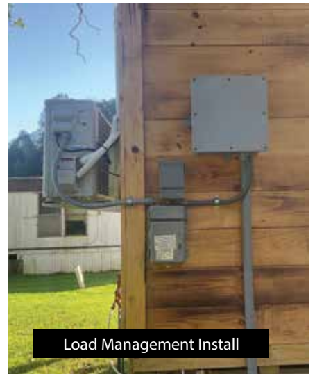
Load Management Install

Looking forward to serving you in the new year!