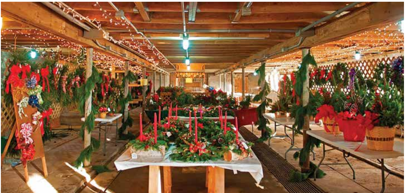
After finding the perfect Christmas tree, guests can shop for wreaths, garland, and other decorations that are available in the Greenery Room.

Cooks' Woods is located at 2176 Ebenezer Road, Fennimore 53809. You can reach them by phone at 608-943-8099 or 608-778-6954, by email at dave@cookswoods.biz or barb@cookswoods.biz , or find them on the web at www.cookswoods.biz . — Judy Mims