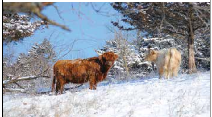
The winning photo for December in SREC's 2024 Member Photo Contest is "Highland Cattle" by Ben Schmidtke of Platteville.